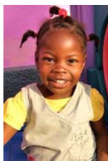
Mafise 27 Feb 2008