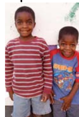
Berthony 8 May 2003 Jeanrismond 3 Nov 2005