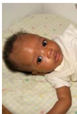
Blanco 1 Nov 2010