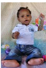
Wadley 11 Aug 2010