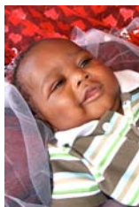
Stanley 1 Dec 2010