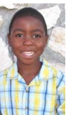
Davidson 17 July 2005