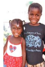
Delta (special needs) 30 Dec 2006 Dieudonne 18 July 2004