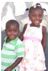
Wanso 25 Dec 2008 Frantzdie 3 Oct 2005