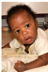
Davidson 11 Nov 2010