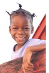
Berline 11 Jan 2006