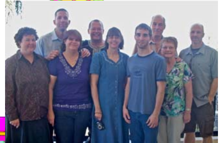
Whitecourt Baptist Team Canada