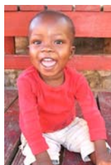
Matnel 28 Aug 2009