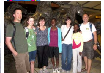
The Tiberio Team Canada