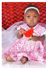
Faland (special needs) 13 Nov 2009