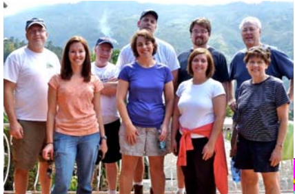
Timberline Church Team