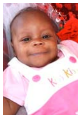
Osmalka Unknown (approx 5 mo.)