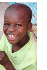
Rilinx 1 Nov 2002