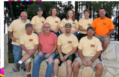
The Crossroads Team #2 USA