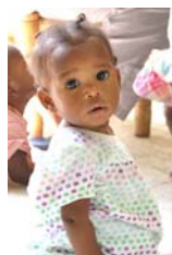
Frantina 6 July 2010