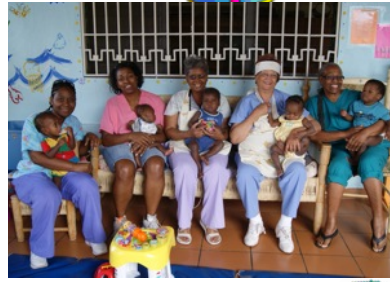
The Grandma Rockers Team USA