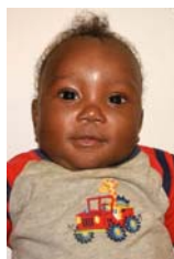
Mickenley 7 Aug 2010