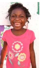
Ghania 1 May 2004